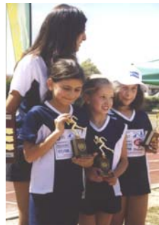
Under 8 Girls

Congratulations to the athletes in these age groups. This is a great effort and bodes well for the future performance of the club with so many stars coming through from our younger age groups.