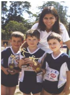
Under 6 Boys

The following TAS age groups won the Doncaster Centre Age Group Award for the 2007/08 season: